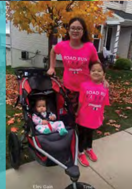
VIRTUAL ROAD RUN 2020